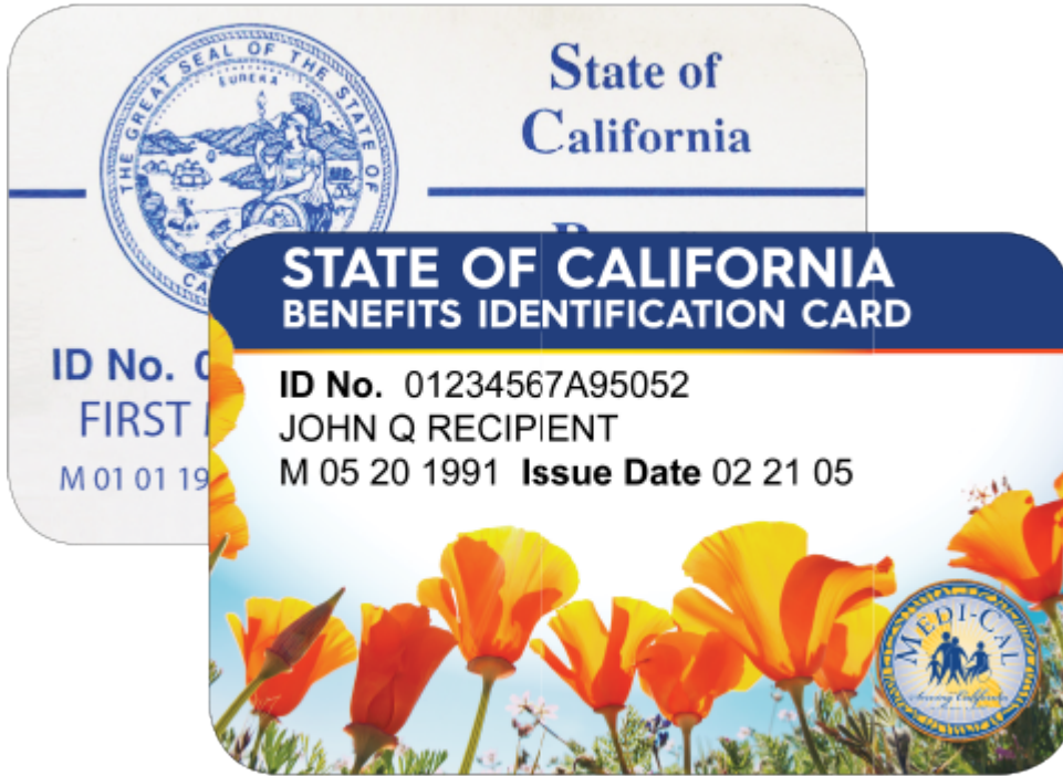
Medi-Cal Card (old/new)